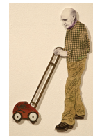
Craig Norton , untitled , 2008 ballpoint pen on cardboard, 18 x 10" Gift courtesy of the artist and William Shearburn Gallery Value: $1,800