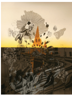
Carmon Colangelo , Sand Castle , 2008 silkscreen on paper, 39 1/2 x 32 1/2" Gift courtesy of the artist Value: $2,800