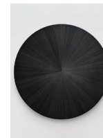
Michelle Grabner , untitled , 2010 silverpoint and black gesso on panel, 24" dia. Gift courtesy of the artist and the Shane Campbell Gallery, Chicago Value: $4,000