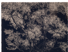
Andrew Millner , Star Magnolia , 2010 lightjet print mounted to plex, 18 x 24" Gift courtesy of the artist and William Shearburn Gallery Value: $1,200

Four VIP Fox Club Box Seats for South Pacific at the Fabulous Fox Theatre Value: $300