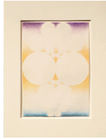
Lisa Beck , untitled , 2010 color pencil on paper, 8 1/4 x 5 7/8" Gift courtesy of the artist Value: $600