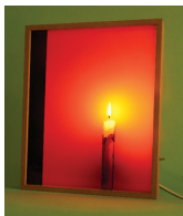
Kelly Mason , OneCandle (Red) , 2010 acetate, acrylic, mylar, mdf, lamp, switch, 15 1/2 x 12 1/2 x 3 5/8" Gift courtesy of the artist Value: $4,500