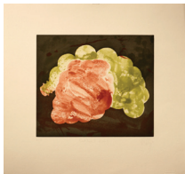
Tony Cragg , Fruit Juice Bottles III, State 2 , 1990 color aquatint with spitbite aquatint, edition of 25, 22 x 23 1/2" Gift courtesy of Wendy Cooper Value: $1,500