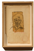
Kit Keith , Cecil , 2006 mixed media on paper, 15 1/2 x 10" Gift courtesy of the artist and William Shearburn Gallery Value: $850