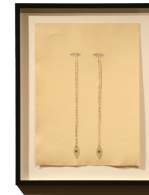
Leslie Dill , Eyes , 1994 lithograph, 18 x 13 1/4" Gift courtesy of William Shearburn Gallery Value: $1,200