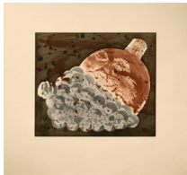
Tony Cragg , Fruit Juice Bottles II, State 2 , 1990 color aquatint with spitbite aquatint, edition of 25, 22 x 23 1/2" Gift courtesy of Wendy Cooper Value: $1,500