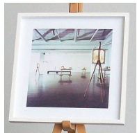
Matts Leiderstam Details forthcoming