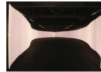
Vicki DaSilva , Space hugger , 2010 photograph/c-print, 20 x 30" Gift courtesy of the artist Value: $500