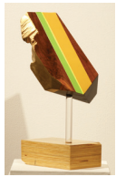
Brandon Anschutz , Mahogany , 2009 acrylic, walnut, gold leaf and plywood, 19 x 8 x 11" Gift courtesy of the artist Value: $1,500