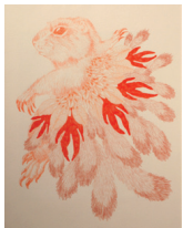
Karin Haas , untitled , 2010 color pencil, 20 x 16" Gift courtesy of the artist Value: $300