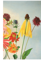
Jennifer Reeves , Josie #7 , 2009 archival ink jet, #2 of 25, 28 x 20" Gift courtesy of the artist Value: $250