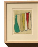
Sue Eisler , untitled , 1989 ink and paint on cloth, 7 1/2 x 5 1/2" Gift courtesy of the artist and William Shearburn Gallery Value: $1,200