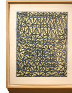
James Siena , Sagging Grid , 2006 reduction linocut, 28 x 21" Gift courtesy of William Shearburn Gallery Value: $3,800